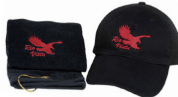
Tee Shirts and Hats