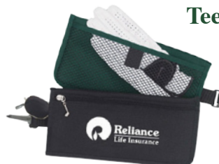
Golf Caddy Pouches