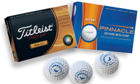
Personalized Golf Balls